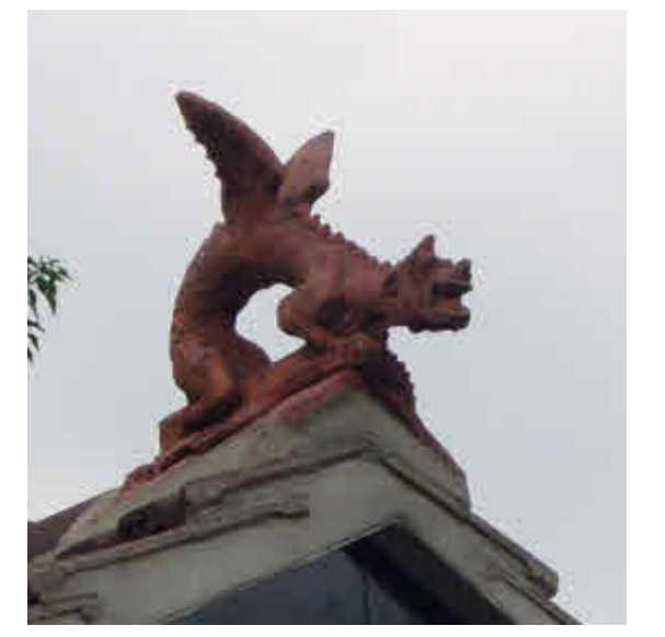
This friendly dragon now greets visitors to Birchanger as it perches on the new roof of a garage that was partially demolished by the recent storms. We're assured it doesn't bite.

To find out more, please call 01279 838132 or email forumsupport.inhouse109@cppih.org